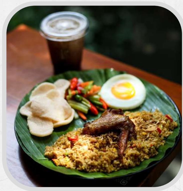
CHICKEN FRIED RICE